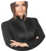
NATALIYA BOYKO Deputy Minister for European Integration, Ministry of Energy & Coal Industry of Ukraine